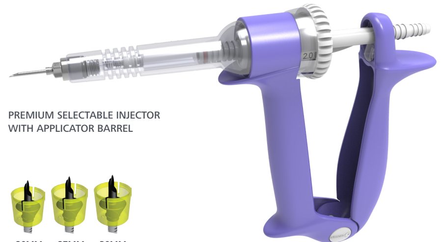
PREMIUM SELECTABLE INJECTOR WITH APPLICATOR BARREL