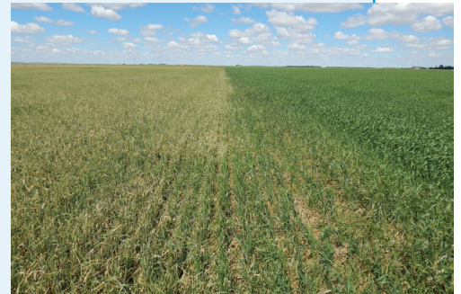
Field on left is neighbor’s wheat. Field on right was treated with Ocean Organics Guarantee® Kelp Extract

Call and ask for our more detailed, scientific research.