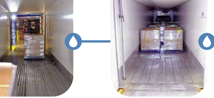
These mixes are shipped to a variety of restaurant locations all over the country to be served as delicious dairy treats we all love!

These different blends are pasteurized and processed to make the following: