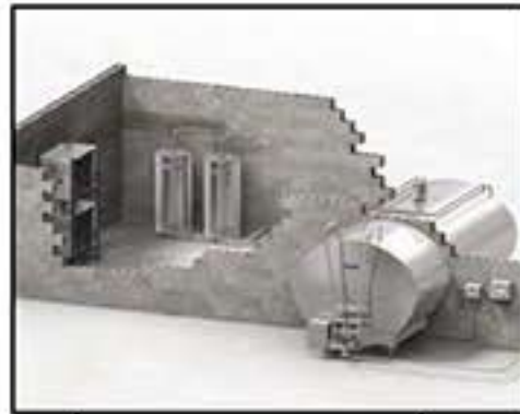
Horizontal milk cooling tanks and plate-heat exchangers