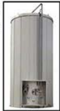
Vertical milk silos/towers