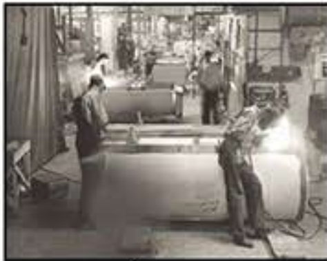
Production of open-top milk coolers